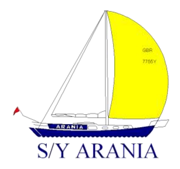
www.steelyacht.co.uk / www.coxengineering.co.uk

Run the system long enough for the symptoms of an overcharge to exist and then remove the valve cap from the suction side service valve. Wearing gloves, eye, and skin protection, and with the system running, cover the top of the valve with a rag or paper towel, holding it there with one hand. Slide the end of a screwdriver or similar tool under the rag or towel with your free hand, and depress the valve core for a short time (say 5 seconds). This should allow some refrigerant gas to escape and maybe some refrigerant liquid. If liquid is released it will immediately evaporate at very low temperatures, so all precautions must be taken to avoid contact between liquid refrigerant and skin or eyes. There will probably be some oil that is released with the refrigerant and this is normal. After releasing some refrigerant, let the system "settle down" for approximately 15 minutes, then visually check the system. On a slightly overcharged system you should see the frost line on the tubing move back towards the evaporator or disappear completely. Repeat the process as necessary until the system shows the symptoms of a correct charge as described in Section 1. On a seriously overcharged system it may take repeated releases before the symptoms of a slight overcharge appear. When the charge has been adjusted correctly replace the valve cap firmly.